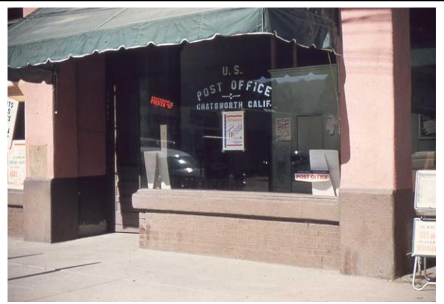
This Post Office was located on the east side of Topanga, south of Devonshire in the Chrisler Building in 1926 through 1959.