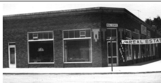
The Lombardi Building was a brick building on the south-west corner of Owensmouth and Devonshire.

Four women served as Postmaster for the next few years. And, by the way, it is always proper to say Postmaster, as the title is used for either male or female Postmasters.