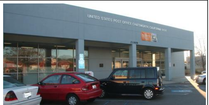
The next move for the Chatsworth Post Office was to its current location at 21606 Devonshire. This building was dedicated in 1970. Temporarily following the 1994 Northridge Earthquake, the Post Office was housed in a trailer west of DeSoto on the south side of Devonshire (where the new water tower/cell phone structure is) until this building was ready to be occupied again.

The Chatsworth Post Office has moved twice since the poster was made. Once to Topanga Canyon Boulevard just to the north on the east side of the boulevard, and again to its present location at 21606 Devonshire St.