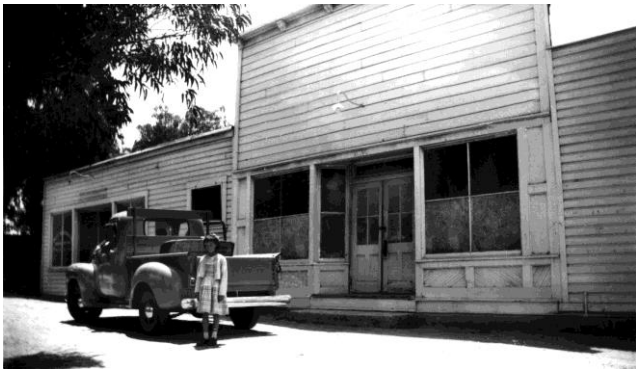
The Civic Building was not only the post office but a meeting location for Girl Scouts. Chatsworth resident Charlene Janess is shown next to the truck outside the building.

The Post Office was moved again to the west of the Southern Pacific Railroad about 300 feet south of Devonshire Street. And it was moved again to the southeast corner of Devonshire Street and Owensmouth Avenue to the Civic Center Building.