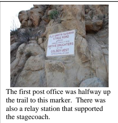
The first post office was halfway up the trail to this marker. There was also a relay station that supported the stagecoach.

former Chatsworth woman, Mrs. Elsa Braun . It was made for the opening of the Post Office when it was located on Topanga Canyon Boulevard just north of Devonshire Street in the 1950s. The poster shows the list of Postmasters and shows where the Post