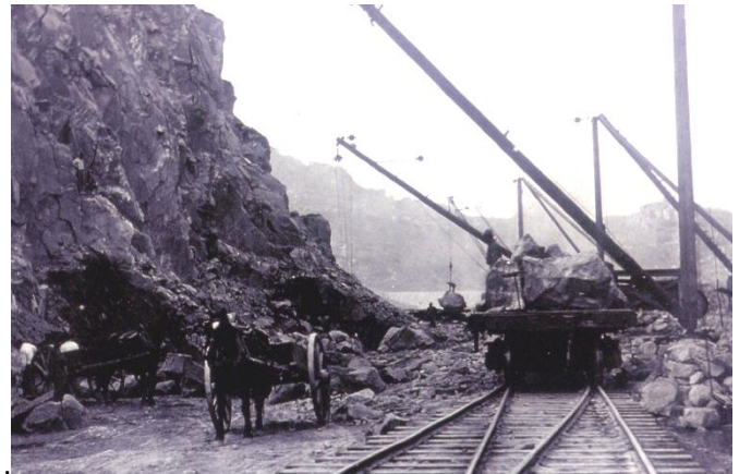
Loading rock at the quarry, notice the rock tongs at center lifting a rock onto a flatbed car.

The sandstone rock formed the core of the San Pedro Breakwater, and was covered by granite to protect it from direct action of the seas.