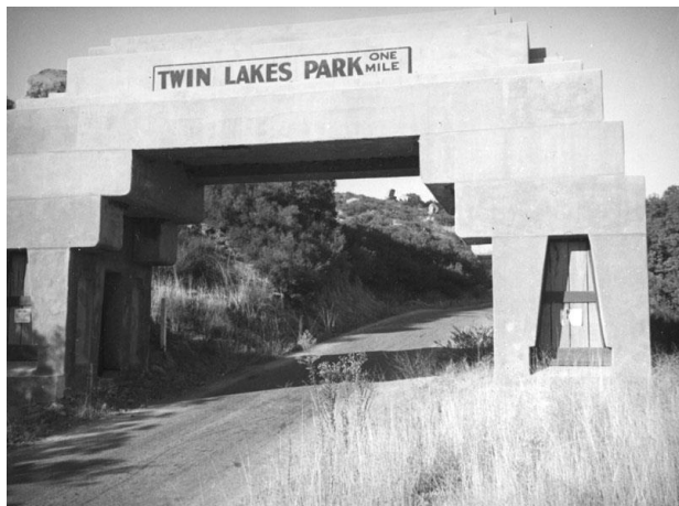
Photo taken in 1935 showing the main entrance at Mayan Road and Santa Susana Pass Road. Although the arch was removed at some point in time, the entrance road existed until Topanga Canyon was extended to the 118 Freeway in 1975. The remains of Mayan Road can still be seen on the east side of Topanga. Today you reach Mayan Road by turning right on Poema just past the Freeway entrance from Topanga.

Twin Lakes is an unincorporated community of homes northeast of the 118 and Topanga Canyon Blvd. The community was created in the 1920's as a rural resort, and promoted as a retreat for the weekend, season or holiday. Similar developments, which were in vogue during the roaring 20's, were Gerard at Ventura Blvd and Topanga (middle-eastern theme), and Rustic Canyon in Santa Monica (Will Rogers and Polo fields). Twin Lakes had an Aztec-Mayan theme.