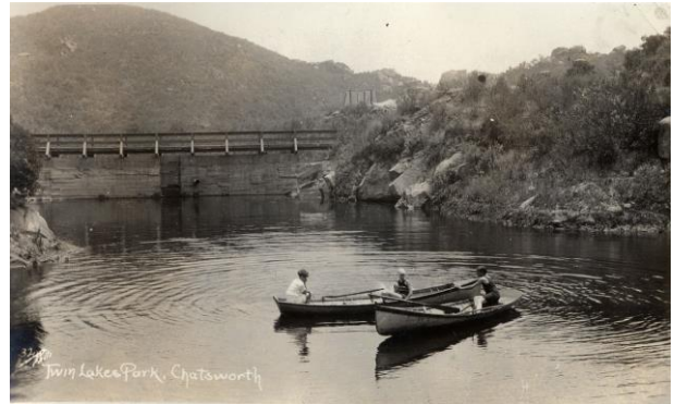
Twin Lake residents boating on Raymond Lake. The Dam shown on the left is still in place and serves as an access bridge to homes north of Devil Canyon. The dam gate was opened in April of 1948 after much discussion of required maintenance and with some hesitation, not knowing if it would refill with the next rain season.

as Raymond Lake) has been dry since 1948. The lake at Browns Canyon dam was silted over in the 40's, but can still be seen today if you drive to the end of DeSoto just north of the freeway, and look up the canyon. Raymond Lake was the centerpiece of the community with the adjacent boat landing, swimming house and Mayan Observation Building. Local Chatsworth residents are known to have been baptized at Raymond Lake.