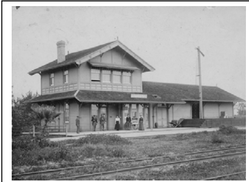
Chatsworth Depot 1893

Chatsworth has a rich history of Train Depots. The original