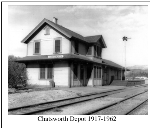
Chatsworth Depot 1917-1962

Depot #2 was torn down in 1962, and Amtrak used a concrete platform on DeSoto Ave. as the Chatsworth Stop until the new Depot was built.