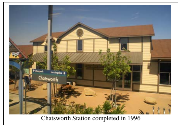
Chatsworth Station completed in 1996

The Chatsworth Transportation Center, completed in 1996, was designed to resemble the community's first depot. Local celebrity residents Roy Rogers and Dale Evans attended the station dedication that April. The goal of the committee charged with planning the facility was to have a hub of activity