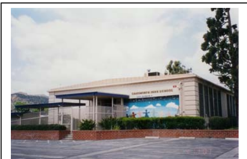
2002 Photo of Chatsworth Park Elementary School

This month a tree fell and damaged part of the main school building and it is still under repair. On November 25, a set of bungalows estimated to have been on site since the late 1930's or early 1940's, were demolished and removed from the school grounds. They were not ADA (Handicap) compliant and not worth converting since they were no longer needed as classrooms. These events continue to create the history of the school as they happen.