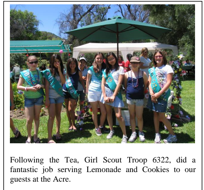
Following the Tea, Girl Scout Troop 6322, did a fantastic job serving Lemonade and Cookies to our guests at the Acre.