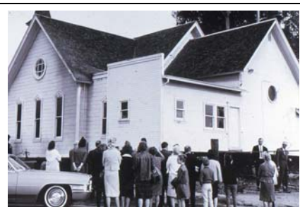
Lila and Bill Schepler coordinated the moving of the Pioneer Church for the Chatsworth Historical Society.

In January of 1965, the Church was moved from its site on Topanga Blvd to Oakwood Cemetery. The goal was to restore it to its original condition; however vandalism and the October 1967 fire scorching the building created additional problems. The Church sat on stilts,