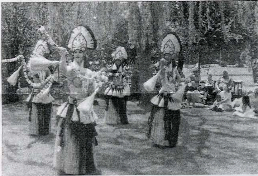
Polynesian dances were performed by young dancers of the Chatsworth Dance Center in lavishly -appointed costumes.