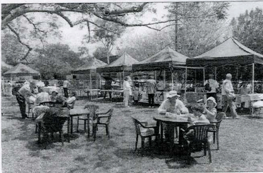
Information and exhibit booths in the background with casual diners in the foreground.