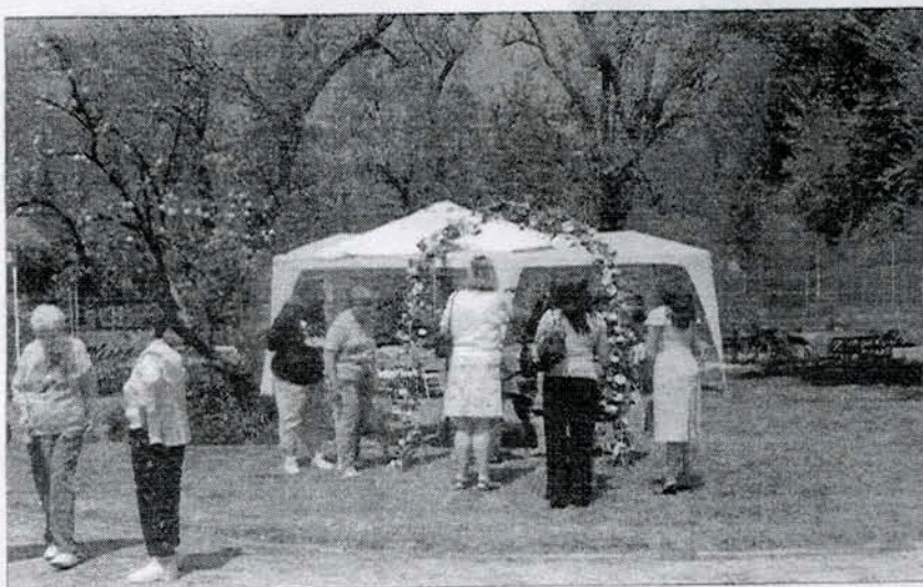
Lineup at the entrance to the Duchess' Tea Room. 130 servings of sandwiches, cakes and tea were served to satisfied customers.