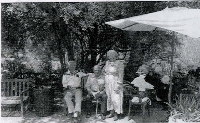
Longtime Chatsworth residents cool off in the shade after sharing reminiscences of early days at the "Old Timers" reception.