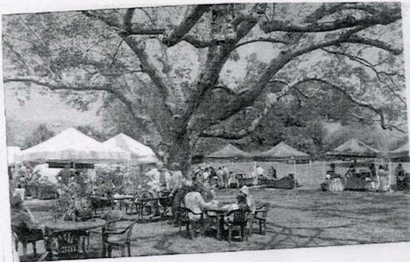
Long view showing the vendor booths in the background and casual attendees under the walnut tree.