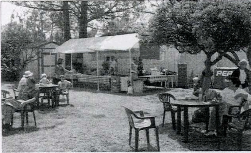
Food and beverage counter in the background served hot dogs and cold drinks.