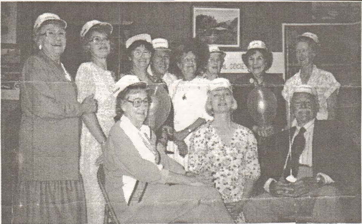
"Hats off to the Chatsworth Historical Society" was theme of 1993 installation of officers in May.

A handy membership form is attached at the bottom of this page for your convenience as well as for new members that you may interest in joining. Please take action now!