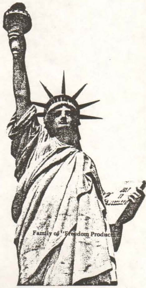
Family of "Freedom Products"