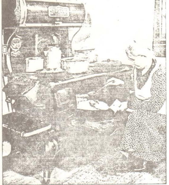
ONE LIKE THIS!